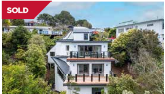
Murrays Bay, 2/5 Dalmeny Close