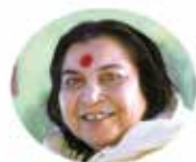
Shree Mataji Nirmla Devi Founder of Sahaja Yoga

Awaken Peace Within Discover your Inner Powers Experience Self-realization