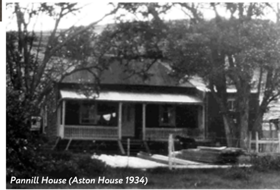
Pannill House (Aston House 1934)

New members are always welcome to join us. Come and help us to keep the Vaughan Homestead here to record the history of this area. Phone or email us to make bookings.