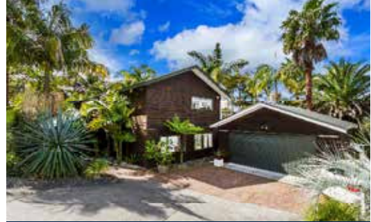
Okura, 266 Okura River Road