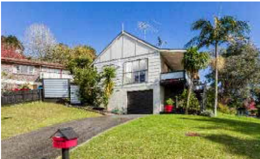
Torbay, 56A Stredwick Drive