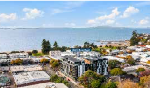
Browns Bay, 504/4 Bute Road