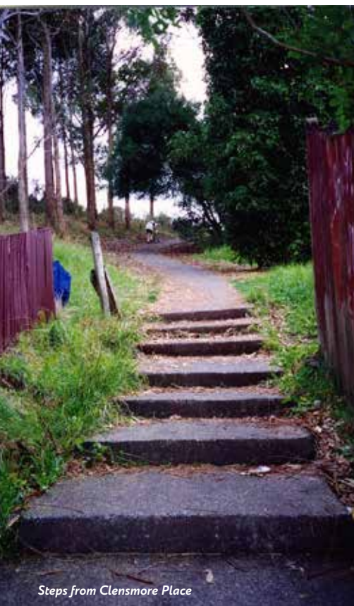
Steps from Clensmore Place