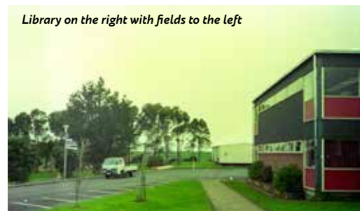
Library on the right with fields to the left