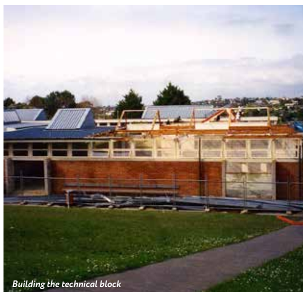
Building the technical block