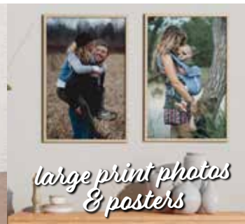
large print photos & posters