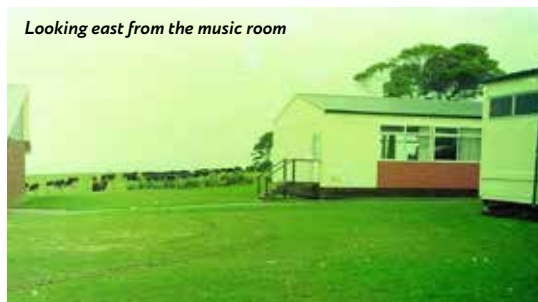
Looking east from the music room