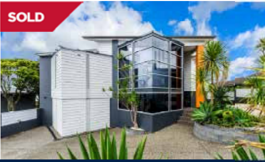
Torbay, 1007 Beach Road