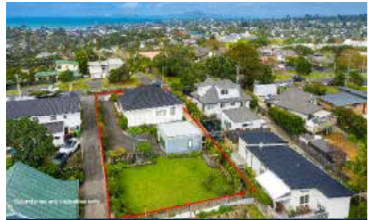
Browns Bay, 904A East Coast Rd