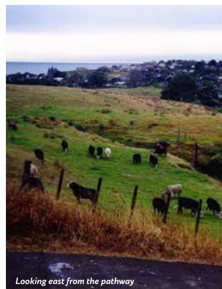
Looking east from the pathway