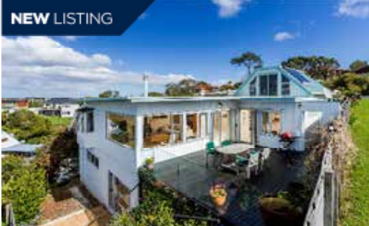
Murrays Bay 1/5 Dalmeny Close